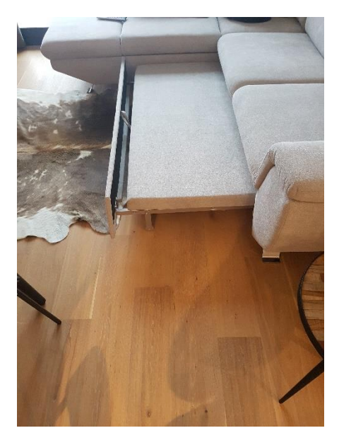
2^{\text{nd}} step: pull the seat up with the strap